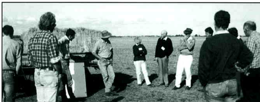
Members of the Warrnambool Beef Manager Group discuss pasture renovation.

For example, meat processing and exporting companies are now keen to establish forward supply contracts with beef producers to supply cattle of required specifications on a consistent basis during the year. Discussion groups of suppliers could be formed to develop the herd management options required to achieve the desired products. Working in groups is more effective than