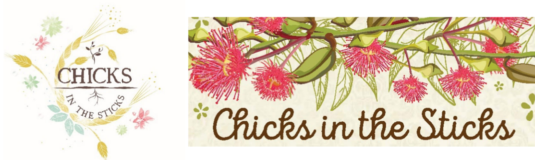
Figure 1. Chicks in the Sticks branding and logos are vital features in the event's promotion

Source: North Central and Goulburn Broken Catchment Management Authorities.