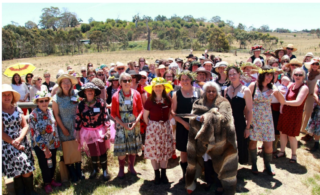
Plate 1. The 2015 North Central CMA Chicks in the Sticks, incorporating glamour, native flora and gumboots, was held along the Campaspe River at the historic DeGraves Mill in Carlsruhe, Victoria

Source: North Central Catchment Management Authority 2015.